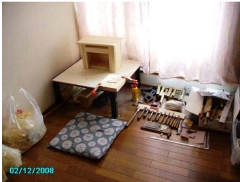
Photo of the 36 Square Feet Shop

I would recommend going for 10x18 if you do have more than 36 square feet of space.